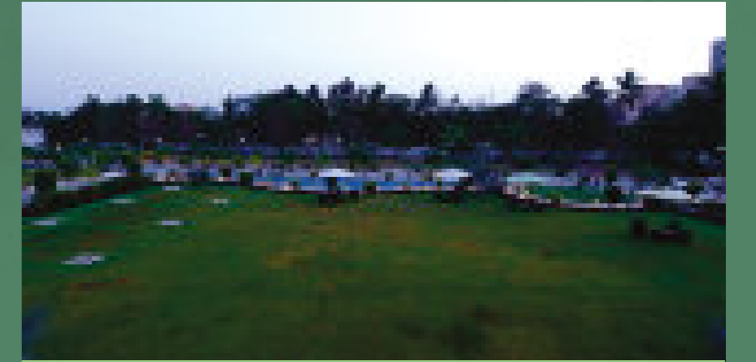
Party Space Garden