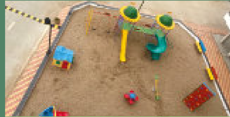
Children Play Area