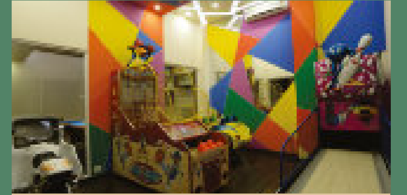
Indoor Children Game Zone