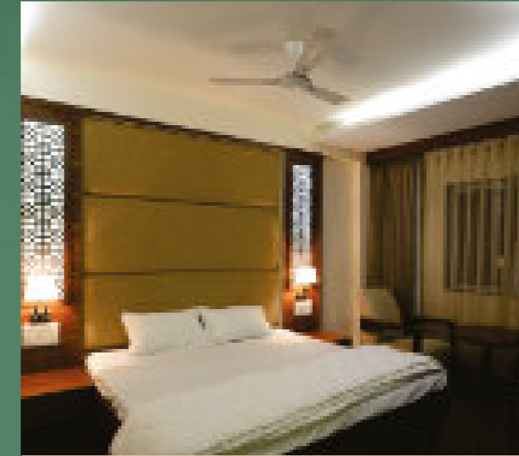
Full Furniture Guest Bedroom