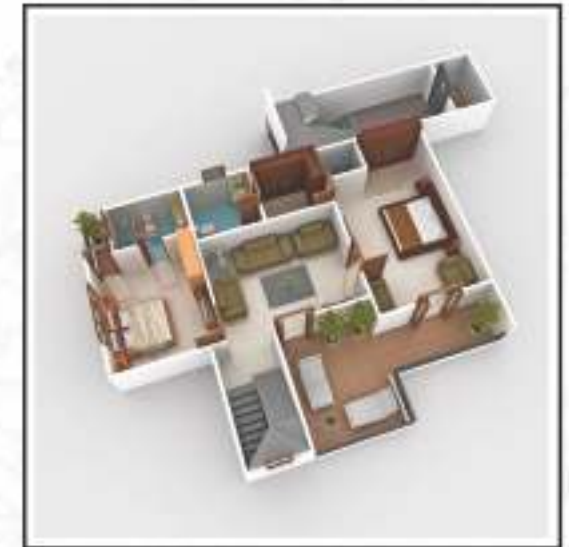
Penthouse (Upper Level)