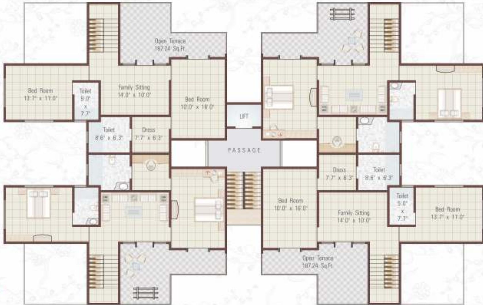
Penthouse (Upper Level)